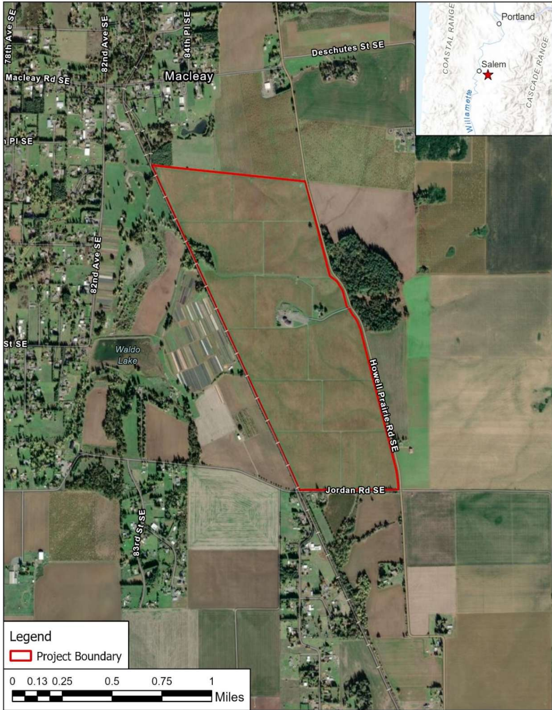
Figure 1. Site Vicinity Map